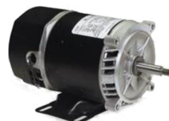
1.5 HP Jet Motor

US MOTORS & MARATHON MOTORS IN STOCK FOR REPLACEMENT ON: