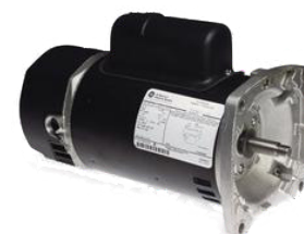
1.5 HP Pump Motor